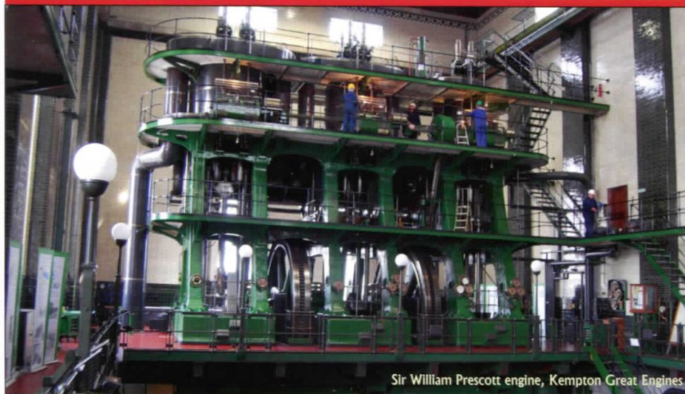
Sir William Prescott engine, Kempton Great Engines

Thursday June 18th-Wednesday June 24th 2015